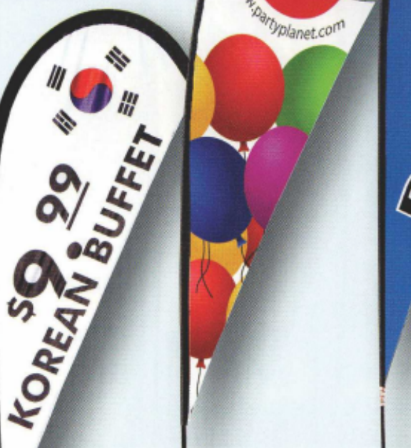
6ft Flag 8ft Flag 1 7ft Pole 1